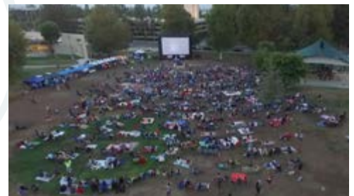
Early arrival of audience and repeated viewing your company brand before showtime