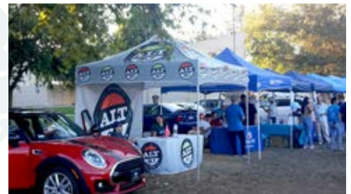
Ample exhibition space for vendors and sponsors adjacent to the crowd