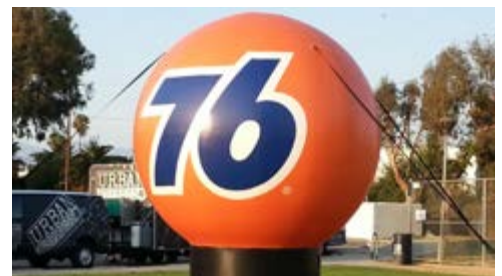
Creative branding opportunities available—make a BIG impression!