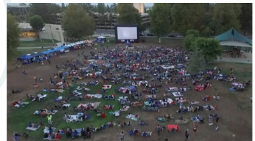
Early arrival of audience and repeated viewing your company brand before showtime