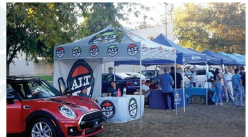
Ample exhibition space for vendors and sponsors adjacent to the crowd