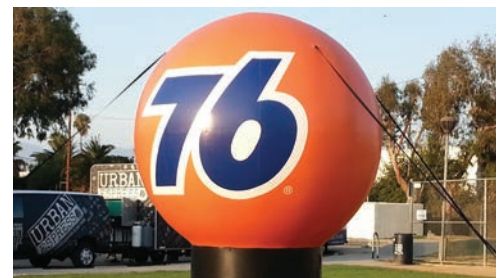
Creative branding opportunities available—make a BIG impression!